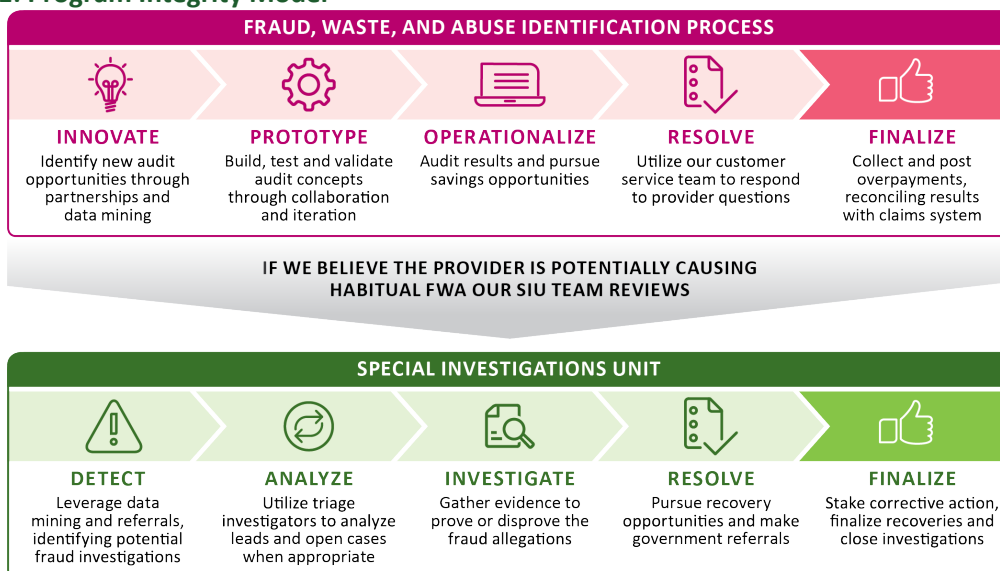
Figure I.C.26-1: Program Integrity Model

Investigations: The SIU is Humana’s primary investigative department, with the Risk Adjustment Integrity Unit (RAIU) being another. The SIU investigates all types of FWA, including employee, Enrollee, and provider FWA. The SIU’s associates have varied expertise including data analytics, clinical credentials, and investigative training and certification and many of them have past experience in law enforcement. In addition, the SIU is also supported by a dedicated clinical team of approximately 80 clinicians. The SIU’s thorough investigation protocol includes onsite reviews as well as reviews including claims data analysis, medical records review, expert review, provider/provider staff interviews, law enforcement collaboration, Enrollee interviews, information-sharing with appropriate entities, etc.